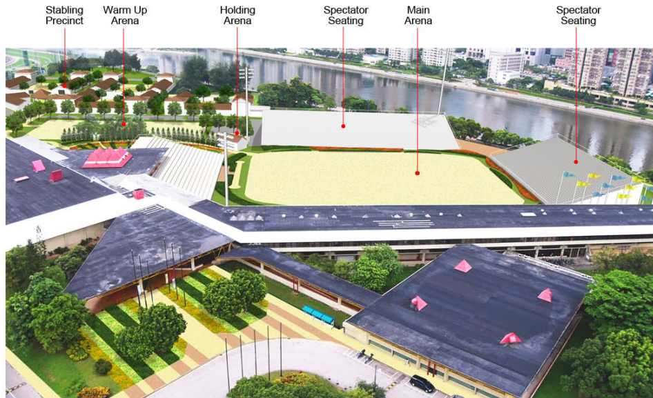
MITIGATED DURING EVENT