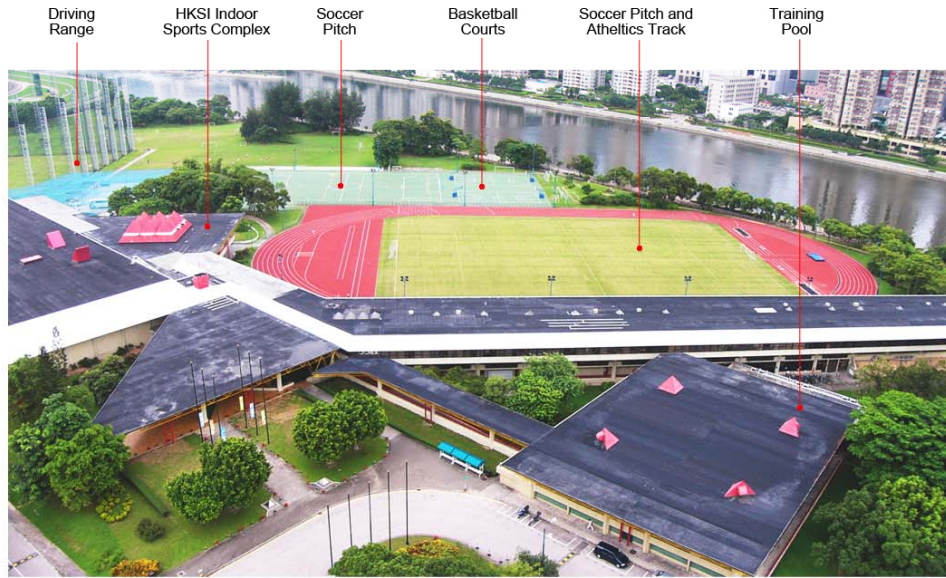
EXISTING VIEW FROM HKJC STAFF QUARTERS